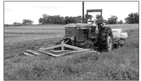
Jeff Moyer, farm manager at the Rodale Institute Farm, rolls down a late-summer-planted, winter-annual legume cover crop of hairy vetch using a specially designed roller-crimper.

3 Value projected using an additive model for carbon sequestration and input adjustments based on system requirements